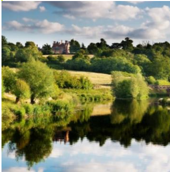
Jubilee River Windsor, UK