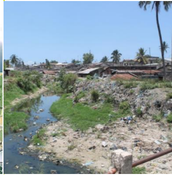
Dar Es Salaam