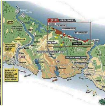
Istanbul New City