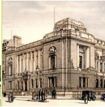
Chartered Engineer Institution Civil Engineers