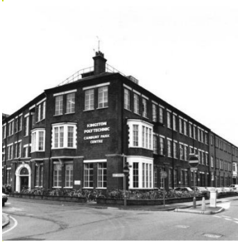
Graduate Kingston Polytechnic