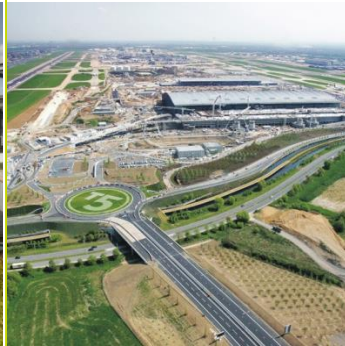
Black & Veatch Chartered 1999