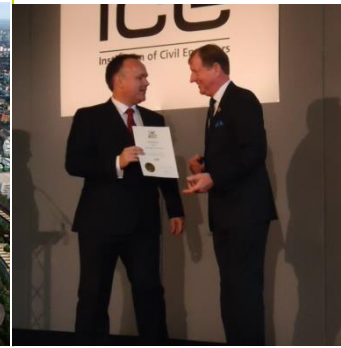
Fellow Institution of Civil Engineers