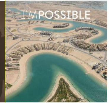
Head of Water BuroHappold