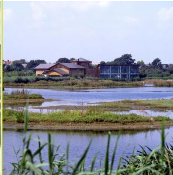
London Wetlands Centre Barn Elms, London