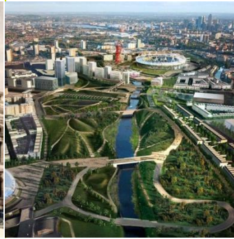
BuroHappold Olympics Team, London, UK