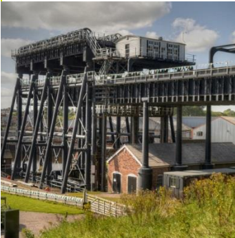
Lewin, Fryer & Partners Graduated Kingston Poly