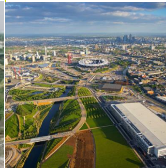
IBC / MPC Olympic Park, London