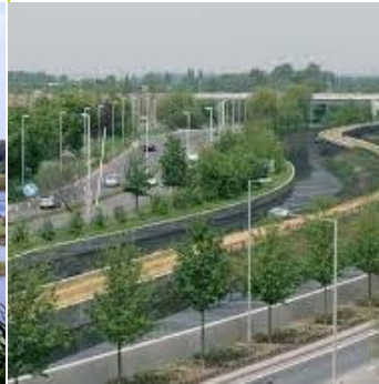
Twin Rivers Diversion Heathrow Airport, UK