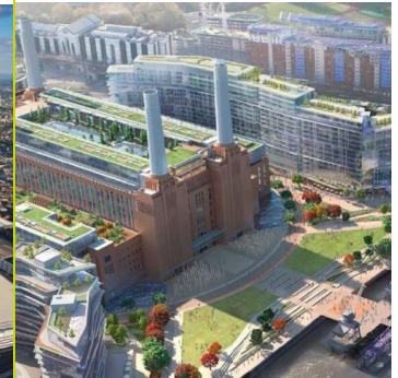
Battersea Power Station London, UK