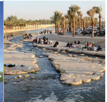
BuroHappold Water Group