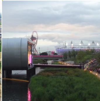
BuroHappold Olympics Team